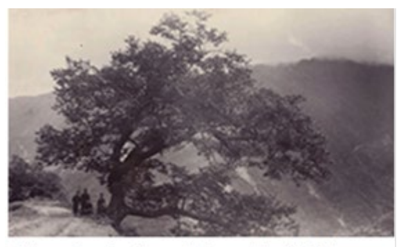
Castanea japonica. Japan. September 2, 1902.

Soon after Jack joined the Arboretum he began collecting and documenting plants in the United States and abroad. During the summers of 1898 and 1900, Jack was an agent for the U.S. Geological Survey and the U.S. Department of Agriculture. He explored the forests of central Colorado and the Big Horn Mountains of Wyoming and produced detailed documentation and photographs of the forest and soil conditions of the Pikes Peak, Plum Creek and South Platte Forest Reserves. In 1891, he visited botanic gardens in France, Germany, Italy, Denmark, and England and in 1904, he and Arboretum taxonomist Alfred Rehder (1863-1949) collected plant specimens and took photographs in the western United States and in Canada.