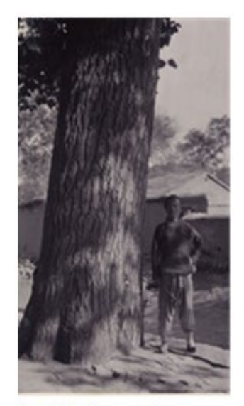
Populus tomentosa. China. J.G. Jack, 1905