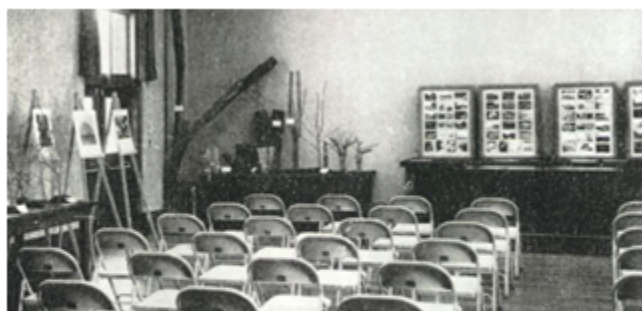
In 1955, the "lecture and demonstration" room was created on the first floor of the Hunnewell Building and the Ektachrome display panels were installed. From "Annual Report" 1955

Up until late 1993 these illuminated wooden cases, whose lighting could be activated by the visitor, were exhibited in the Hunnewell Building either in the entrance hall or lecture hall. Upon occasion the cases were displayed at other locations outside the Arboretum in