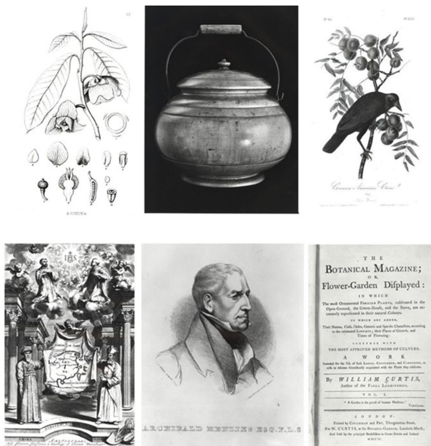
A selection of images from the collection

The guidebook project resulted in a series of three books being published about the Arboretum: A Reunion of Trees (1990), by Stephen A. Spongberg and New England Natives (1994), by Sheila Connor and Science in the Pleasure Ground by Ida Hay. The series was funded for planning in 1981 and for completion in 1984 and 1987 with grants from The National Endowment for the Humanities. This collection consists of prints and negatives that were created for A Reunion of Trees and New England Natives . The collection consists primarily of black and white images of book titles pages and content, portraits, plates from monographs and journals depicting specific plants, maps, plans, close-ups of fruits and flowers, and object made from wood.