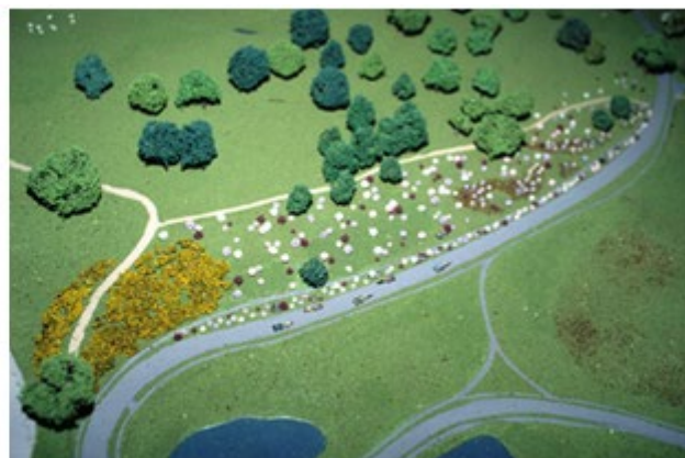
Lilac collection in "bloom"

The 8'x16' scale model of the Arnold Arboretum landscape provided a centerpiece for the exhibition and included more than 4,000 miniature trees that replicate the Arboretum's living collection. Built on a 40':1" scale, the model employed as many as 20 different shades of green. Vignettes of different eras in the Arboretum's history were featured on the model. Other parts of the exhibit highlighted the cultural history of the Arboretum, the design of the landscape, plant collecting expeditions, forest conservation, American horticulture, and the many uses of wood and the collaboration between Charles Sprague Sargent, the Arnold Arboretum's first director and Fredrick Law Olmsted, America's preeminent landscape architect.