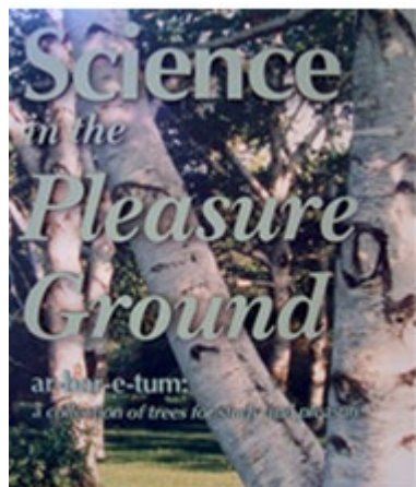
Exhibit's introductory panel

The exhibit "Science in the Pleasure Ground" opened on October 18, 1996, in the Arboretum's Hunnewell Building in celebration of the Arnold Arboretum's 125th Anniversary. A product of 6 years of planning, it highlighted the cultural history of the Arboretum, the design of the landscape, plant collecting expeditions, forest conservation, American horticulture, and the many uses of wood.