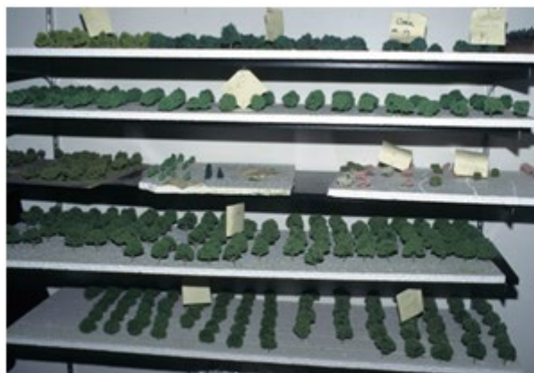
"Trees" awaiting planting

Cambridge, Massachusetts designed the exhibit, GPI Models of Boston constructed the scale model, and WB Incorporated fabricated and installed the exhibit.