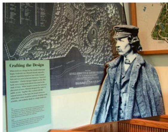
Fredrick Law Olmsted and his plan for the Arboretum