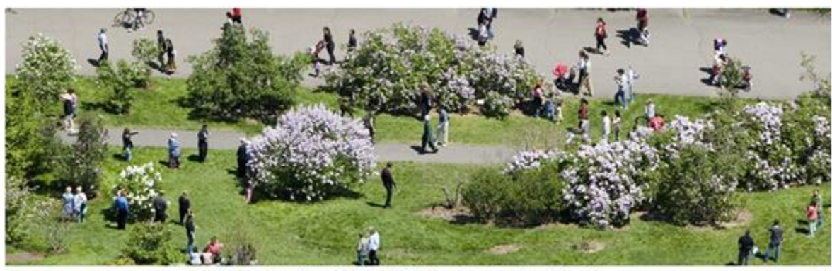
Lilac Sunday, May 13, 2007.

Series II: Photographs. Most images depict visitors walking through the lilacs, on the grounds, or in front of the Hunnewell Building.