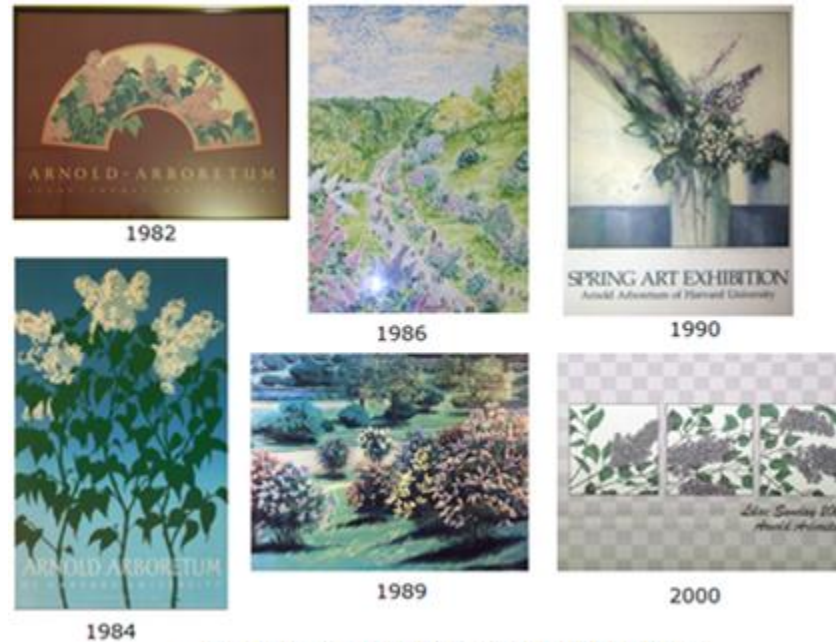
A selection of Lilac Sunday posters

Series III: Posters. Includes photographs of Lilac Sunday promotional posters and related material. For more information about the posters, see the Art and Artifact database inventory (on-site only).