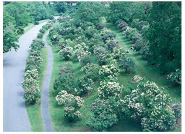
Lilacs, Spring, May, 1972.