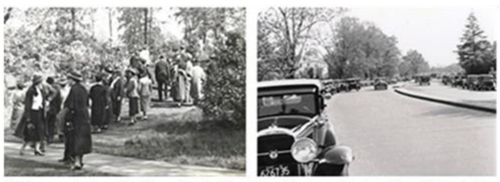
Visitors enjoying the lilacs ( on left ) and parking on Centre Street ( on right ) during Lilac Sunday, 1936, both photographs by Donald Wyman

Series IV, Historical Press Coverage, contains materials located in Arnold Arboretum Scrapbook 7. For more information on scrapbooks, please contact the library.