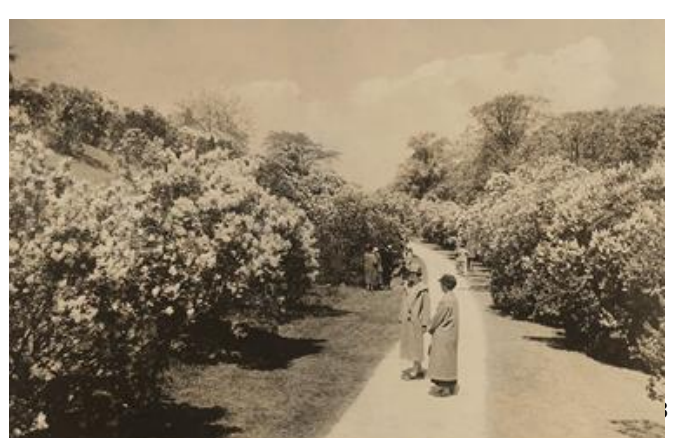
Lilacs, Spring.

about May 24<sup>th</sup>." The following year, he saw "... every reason to believe that many of the plants will be in full bloom by Saturday, the 29<sup>th</sup>." While they may have been at their peak on Saturday, the Globe ran coverage of the event under the heading "LILAC SUNDAY AT THE ARNOLD ARBORETUM" (May 31, 1920).