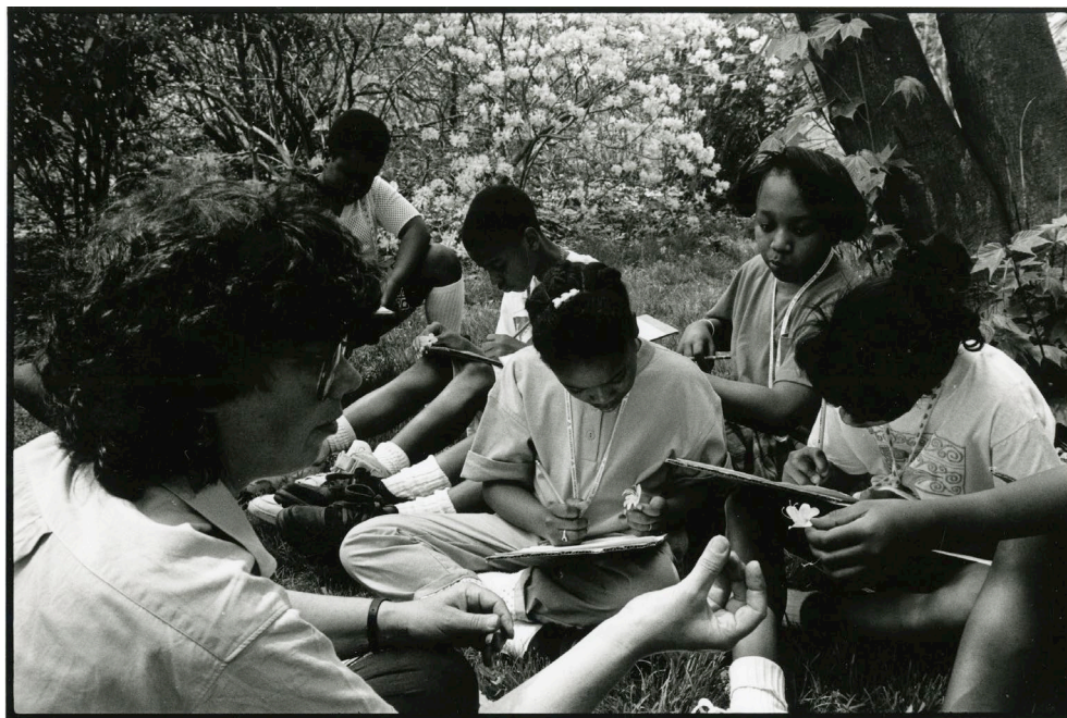
Image 1: Students from the Joseph Lee Elementary School during an FSE, May 1992.

See also: https://arboretum.harvard.edu/education/field-study-experiences/