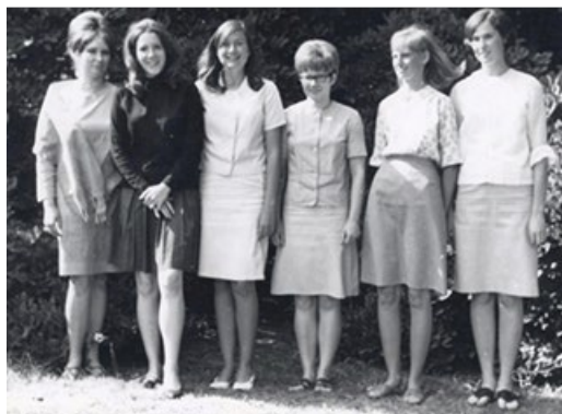
"Herbarium Mounter Summer Help and others" 1966 (title from sleeve) August 1966, in front of Hunnewell Building, photograph taken by Heman Howard, no names provided, 2, 5"x7" b&w prints, 2 negatives ( above right ) "School Girl Mounters – Summer Help" (title from sleeve) August 1966, in front of Hunnewell Building, photograph taken by Heman Howard, no names provided, 1, 5"x7" b&w print, 1 negative ( above left )