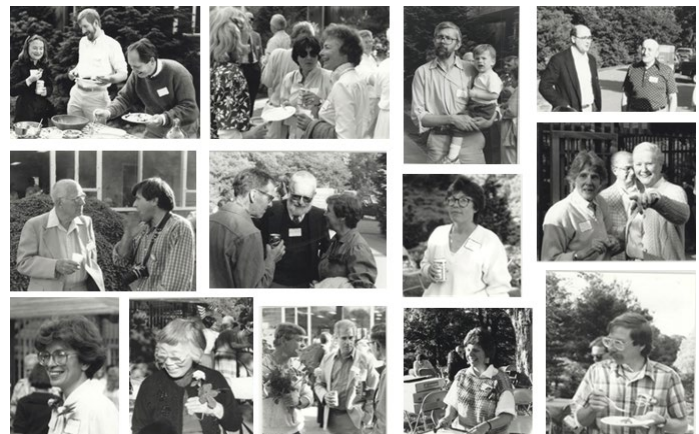
Selection of Retirement party images (right)