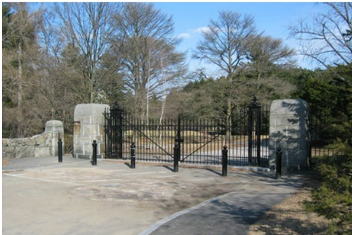
Restored Walter Street Gate 2004

The Arboretum undertook a major gate restoration project in 2002, affecting primarily the Bussey and Walter Street Gates. Workers restored the stone walls and ironwork at the Walter Street gate, removed asphalt pavement within the Arboretum and replaced it with a stone dust pedestrian surfacing from Hemlock Hill Road to the Walter Street gate, repaired and rebuilt the perimeter stone