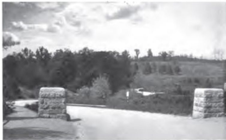
Gates at the Arboretum before any ironwork, 1898