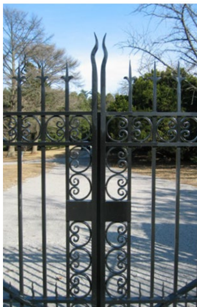
Renovated Walter Street Gate 2004