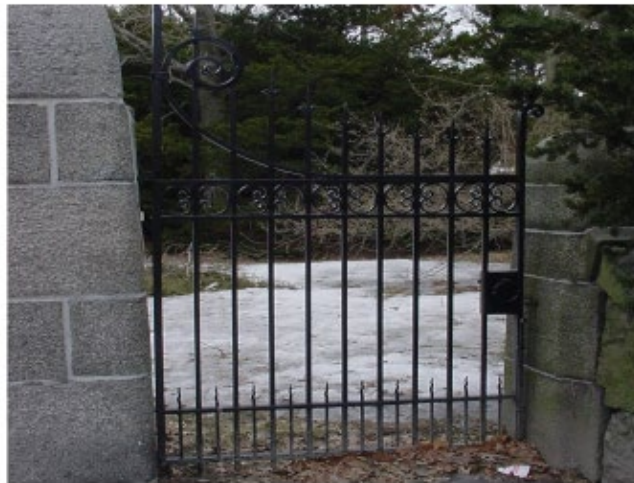
Renovated Walter Street Gate, 2002