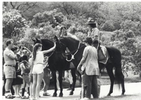
Mounted Park Rangers at the Arboretum 1983

The Boston Park Rangers program was based on the urban ranger program in New York City and operated seasonally from 1982 until 1988. During the first year, Boston Park Rangers patrolled the Boston Common, the Public Garden, the Commonwealth Avenue Mall, and the Arnold Arboretum. That first year the Boston Park Ranger Mounted Unit, which was established through a coordinated effort with the Boston Police Department and the Boston Parks and Recreation Department, patrolled the Arboretum on horseback. In the following years the Ranger program was expanded to include Franklin Park, Jamaica Pond and the Back Bay Fens.