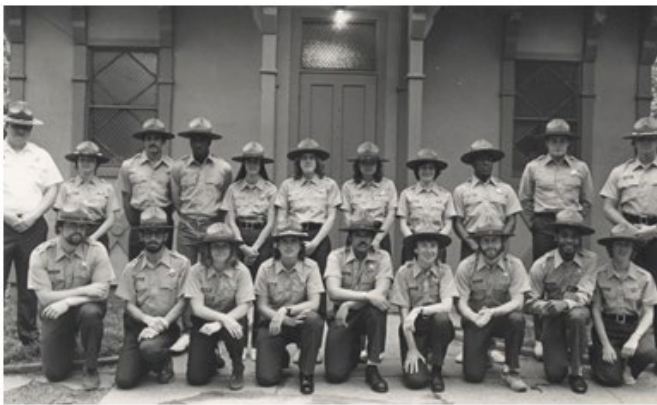
Boston Park Rangers 1983

The late 1970s and early 1980s saw an upswing in violence and vandalism in Boston, which led to a subsequent drop-off in visitation to city parks. Responding to the growing concern for Boston's parklands, in 1982, under the aegis and management of the Boston Parks and Recreation Department, the Massachusetts Association for Olmsted Parks, The National Association for Olmsted Parks, Friends of the Public Garden