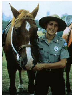
Mounted Park Ranger, unidentified, undated, photographer unknown