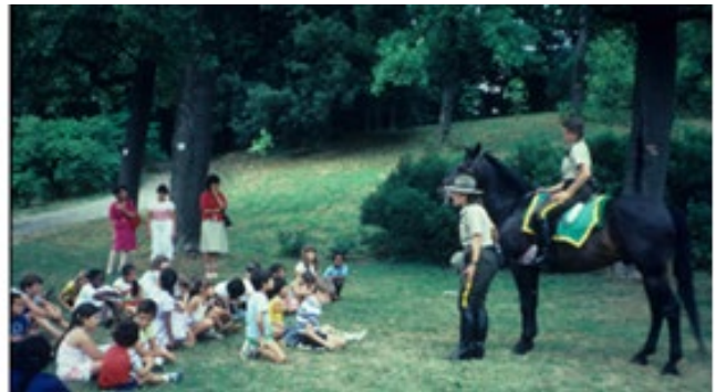
Mounted Park Rangers at the Arnold Arboretum, undated