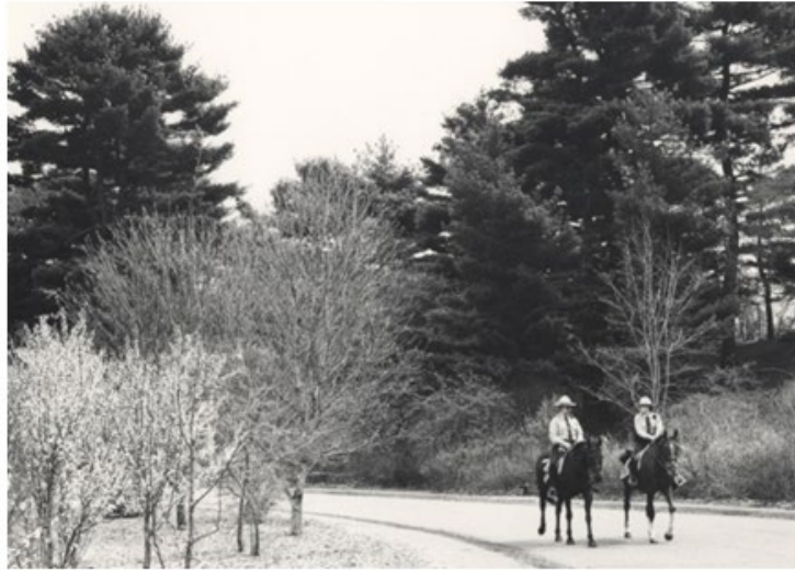
Boston Mounted Park Rangers patrolling the Arboretum, Forest Hills Road, 1991