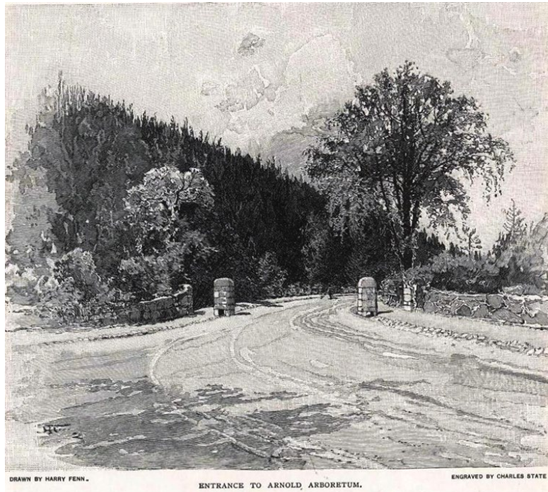
"Entrance to Arnold Arboretum"

From M.C. Robbins "A tree museum." The Century Magazine , April 1893, page 867