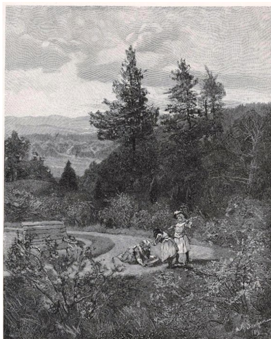
View from the top of Bussey Hill