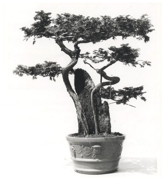
Chamaecyparis obtusa 'Chabo-hiba' (Split rock). Unknown photographer, 1954