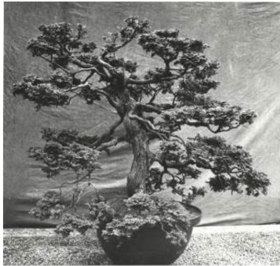
Chamaecyparis obtusa 'Chabo-hiba' (Straight arm), 1989