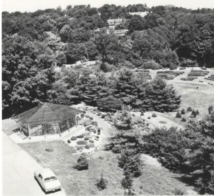
Bonsai House (left), Dwarf Conifer Collection (center), and Hedge Collection (background right), 1972

2e. Subject exterior aerial view centennial Number 4 prints Date May 1972