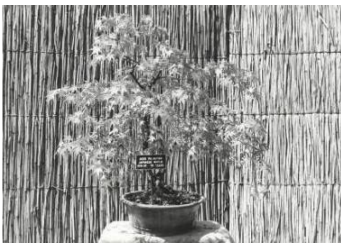
Acer palmatum