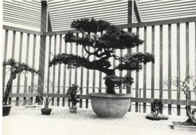
Chamaecyparis obtusa 'Chabo-hiba' (Bertha). 1962