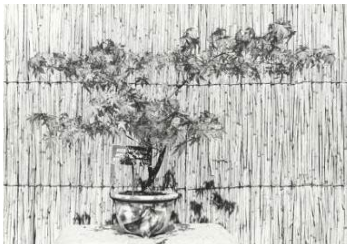
Acer palmatum, 1963