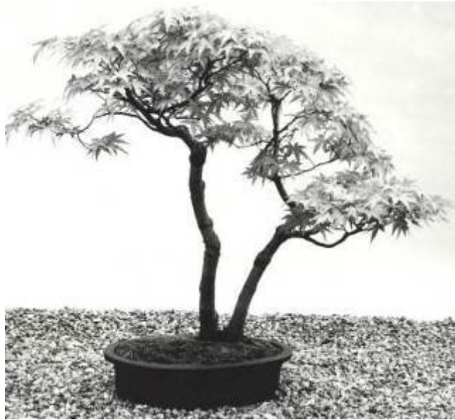
Acer palmatum