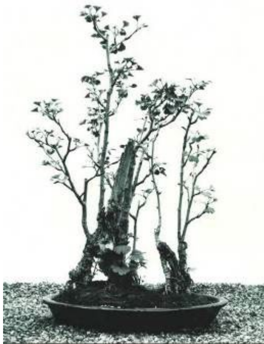
Ginkgo biloba (Shanghai)