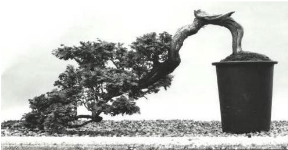
Chamaecyparis obtusa 'Chabo hiba' (child)