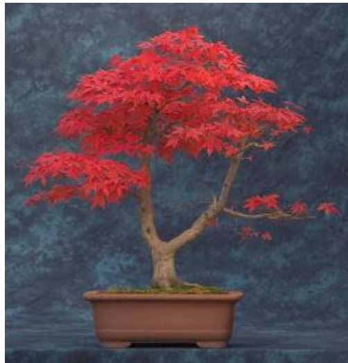
Acer palmatum (Red Leaf)