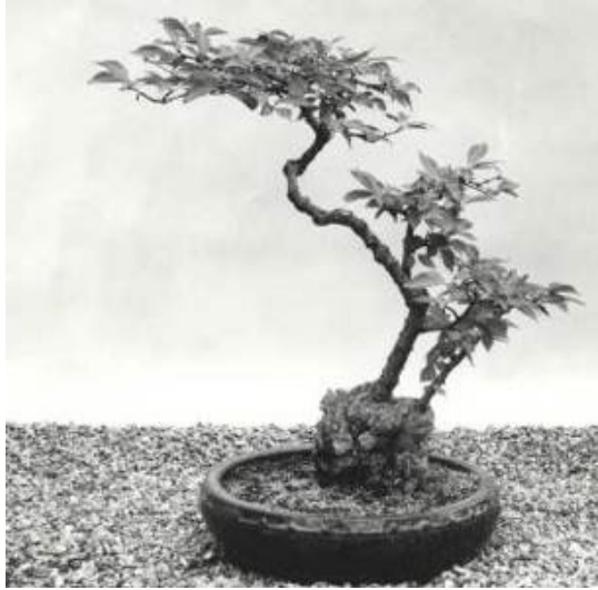
Prunus subhirtella.