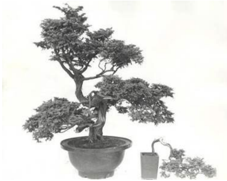
Chamaecyparis obtusa 'Chabo-hiba' (mother) with (child).