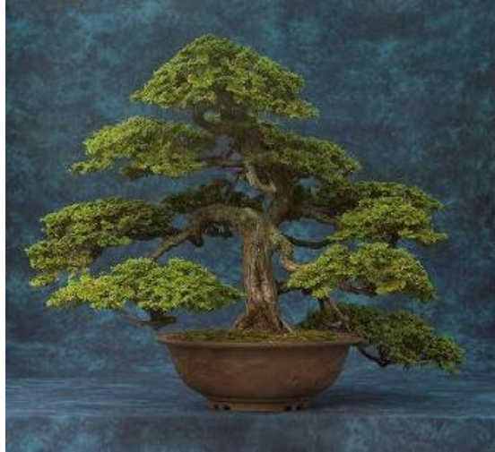
Chamaecyparis obtusa