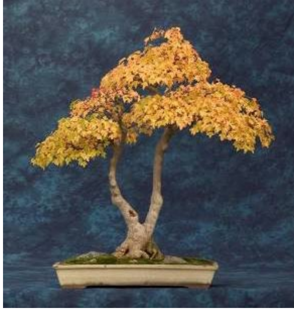
Acer buergerianum