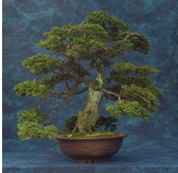
Chamaecyparis obtusa 'Chabo-hiba' (Octopus)