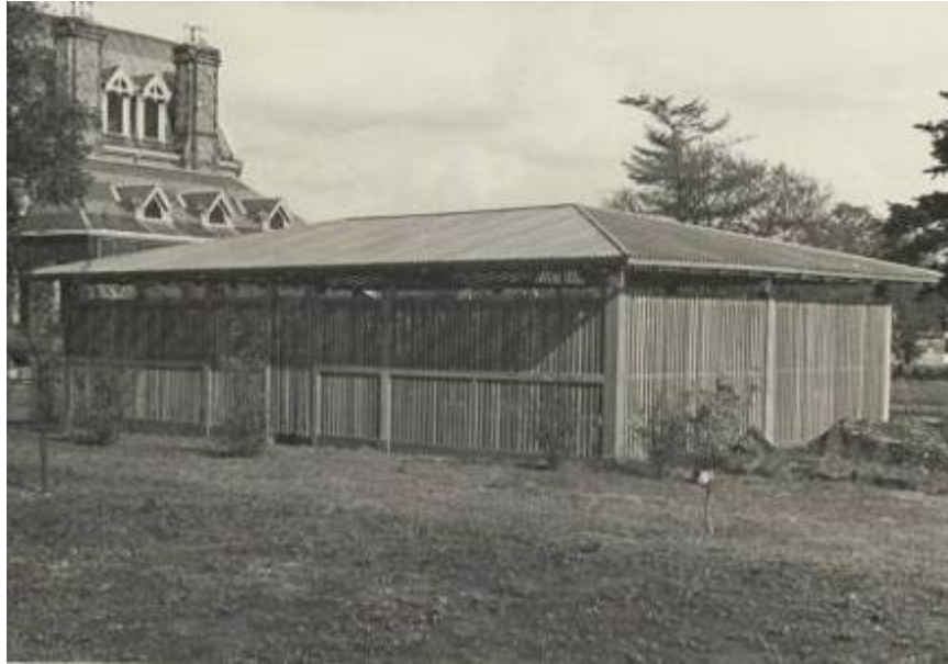
Original Bonsai House on Bussey Institute grounds. Photographed by Donald Wyman, 1938