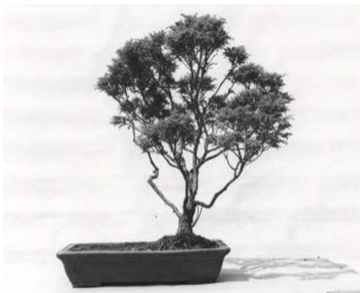
Chamaecyparis pisifera 'Squarrosa'. 1954