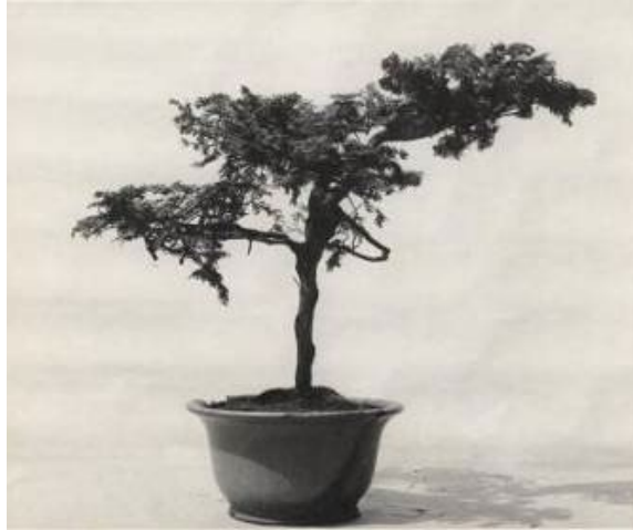
Chamaecyparis obtusa . 1954