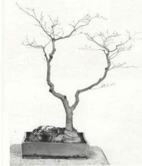
Acer palmatum (Tuning Fork) photographed by Heman Howard, 1965