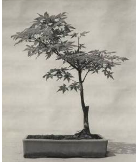
Acer palmatum . Unknown photographer, 1954