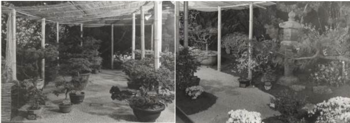
The Arboretum's Bonsai display at the Massachusetts Horticultural Society's Spring Flower Show. March, 1954

6c. Bonsai at the Mass. Horticultural Society Spring Show, March 20, 1954.