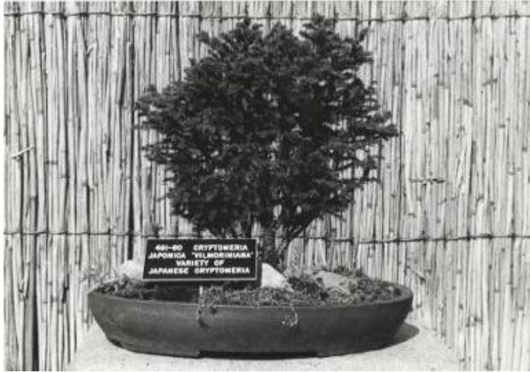
Cryptomeria japonica 'Vilmoriniana'