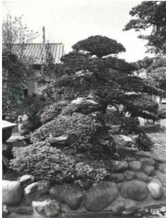
Chamaecyparis obtusa var. nana at Yokohama Nursery, Japan.