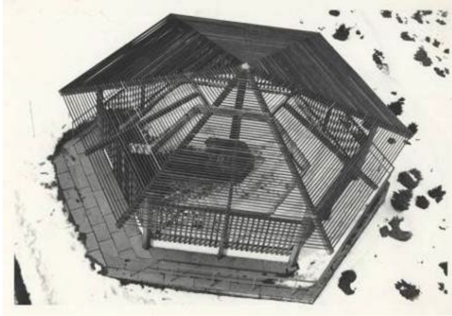
Bonsai House, circa 1962