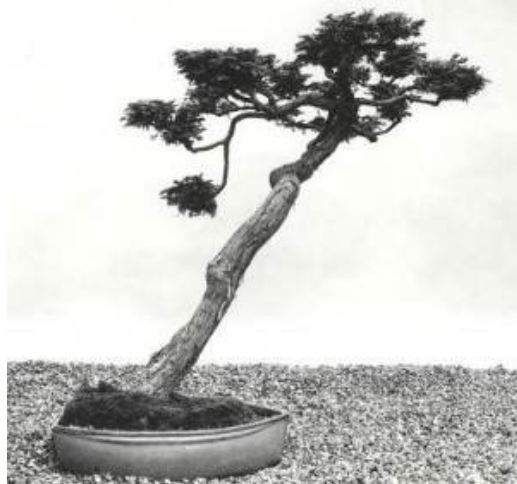
Chamaecyparis obtusa 'Chabo-hiba' (Boat)