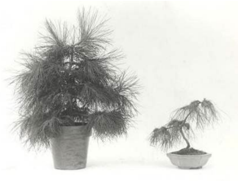
Pinus halepensis . P. Chvany, undated