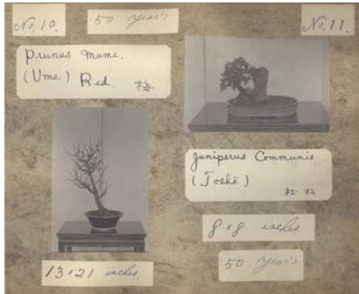
Prunus mume and Juniperus communis . Pre-1937