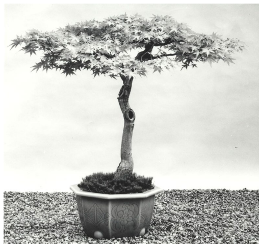
Acer palmatum