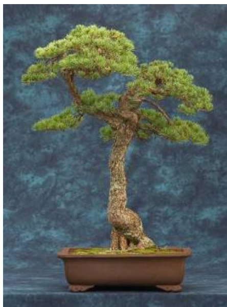
Pinus parviflora, 2005