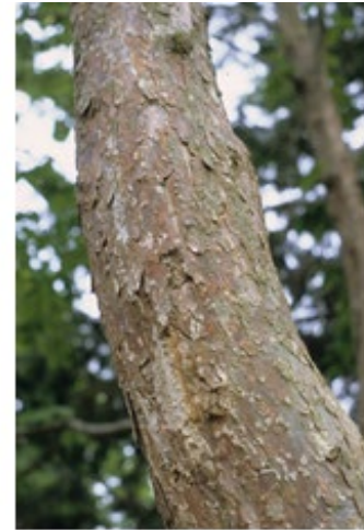
Davidia involuocrata var vilmoriniana