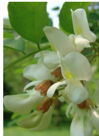
Robinia pseudoacacia 'Burgundy'