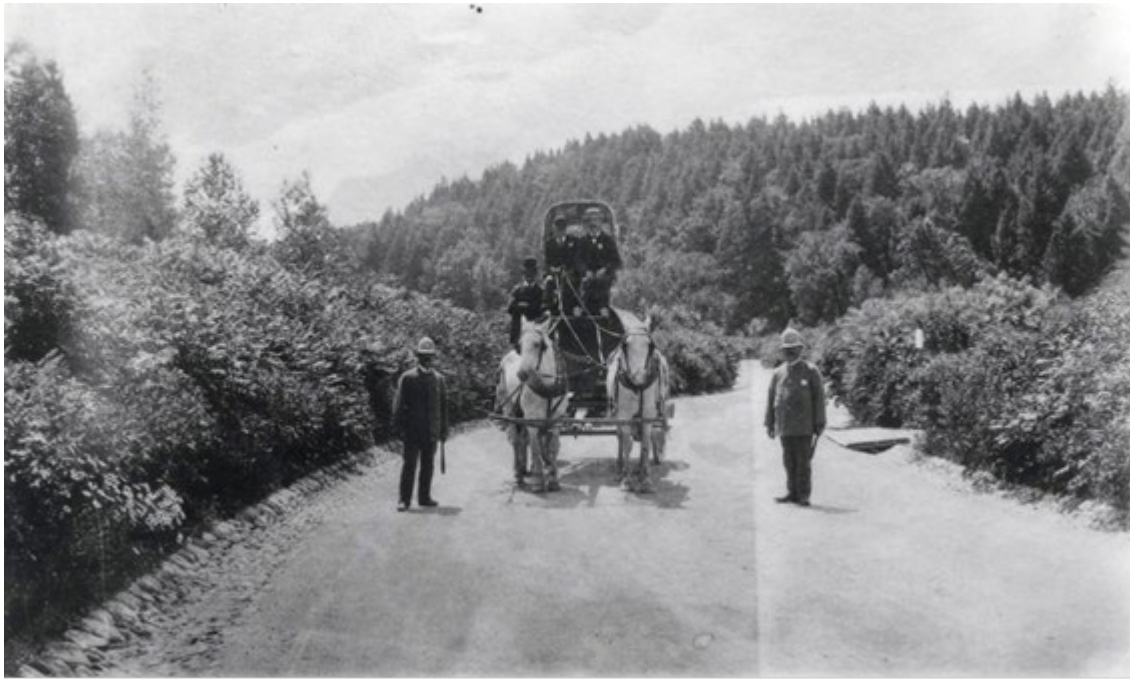
Raup may have reproduced this image of Valley Road with Hemlock Hill in the background. The image clearly shows the cobble gutters and a ramp on the right-hand side that enables vehicle access to the collection. The ramp may be positioned at the site of "Rockery Spring." From Series III, Folder 4