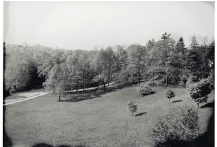
Two images of the Arboretum's Meadow Road and adjacent meadow taken by Raup from the roof of the Herbarium Wing possibly to be used in his article on the history of the meadow area. From Series II, Folder 5