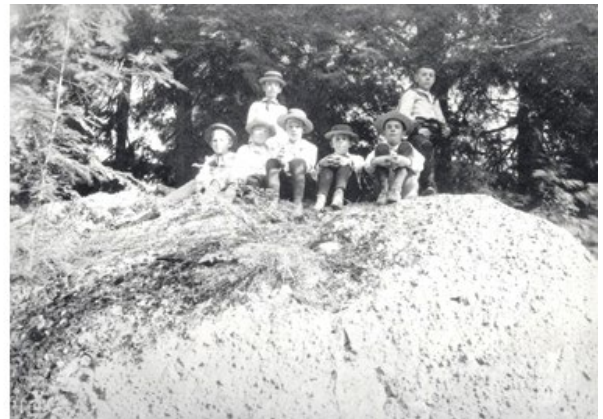
An outing of six young, unidentified boys to two locations on Hemlock Hill, original images may have been re-photographed by Raup. From Series III, Folder 4