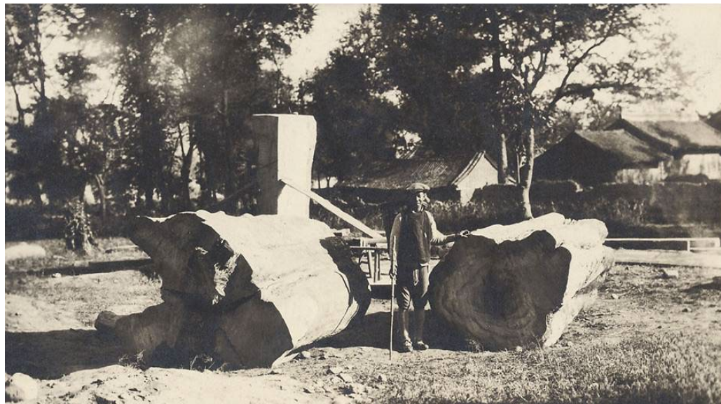
Ailanthus altissima . China. 1919

Correspondence between Joseph Hers and Charles Sprague Sargent can be found in Charles Sprague Sargent's letterbooks, IB CSS, Series II, Box 9: (8/27/1919, p. 431, and 9/12/1919, p. 455). Letters between Joseph Hers and Charles Sprague Sargent are also housed in Sargent's Pre-1927 Correspondence file.