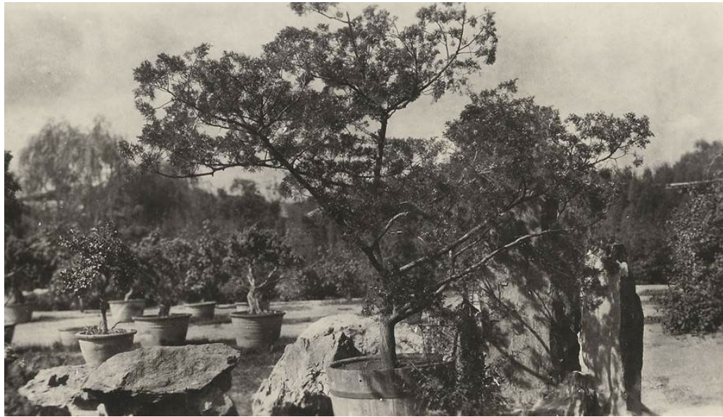
Juniperus chinensis . Honan, China. c1923