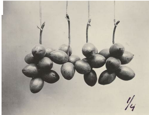
Juglans . China. June 23, 1923

village children, his height and voice made the timorous Chinese officials of those days cringe in fear.