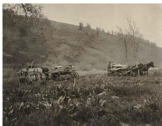
Siberia, Alati, Our camping place near some tall larches, June 7, 1911, photograph by Frank Meyer