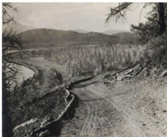
Siberia, Altai. The road leads north and Northeast, June 11, 1911