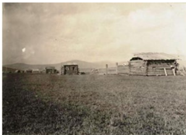
Siberia, Alati, The Russian settlement of Ak-Selan, June 6, 1911