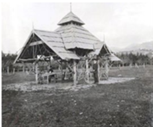
Russian Caucasus. Tea house on an imperial estate, Chakva, where one may order a cup of tea, February 23, 1910, photograph by Frank Meyer

As of 2012, most of the Arboretum's holdings of Meyer's photographs of central Asia have not been digitized. However, although it may not be a complete record, a searchable list is available of Meyer's images taken in parts of Russia, Siberia, Mongolia, Turkestan, and the United States and includes date, country, plant name, and description of the image. The description of the image usually includes plant name(s), more information about the plant(s), Meyer's observations on the subject, a detailed location where the picture was taken, and its date. The following eight images are a representative sampling of Meyer's images of central Asia.