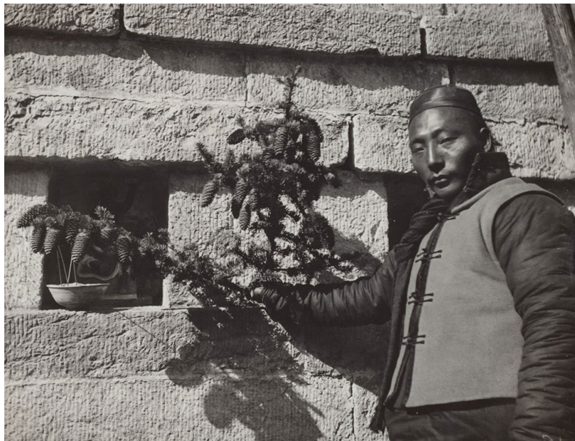
February 26, 1908