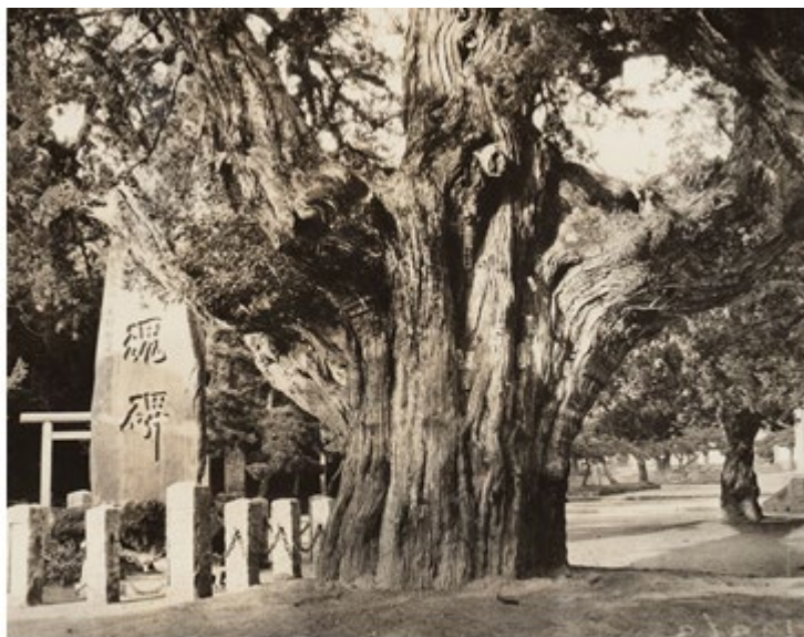
Juniperis chinensis. Kamakura, Japan. A remarkably large specimen of Chinese juniper in the grounds of the Kenchoji (?) temple, many centuries old. September 15, 1915