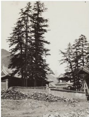
April 24, 1907