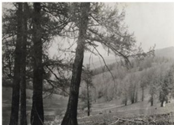
Siberia, Altai. As we march further north we pass a rolling country, June 9, 1911