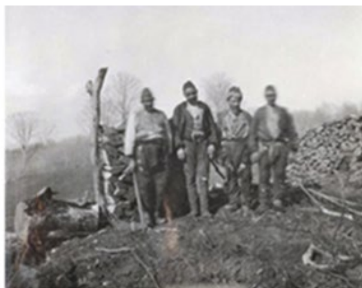
Russian Caucasus, A motley crew of woodchoppers. These men are mainly Turks, hardworking and sober, but they do not earn much over 60 to 80 Ropesks per day, Chakva near Batorim, February 23, 1910