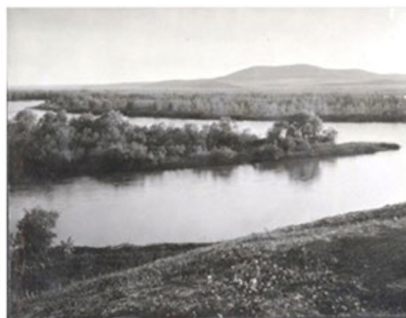
Two Views: Siberia, Irtysh River. The beautiful scenery along the Irtysh River. With the irrigated vegetable gardens of Krasnoyarsk lying at the foot of the cliffs, this is an arid country and it is only where water is in reach of the roots that one finds trees of any size. September 29, 1911, photographs by Frank Meyer