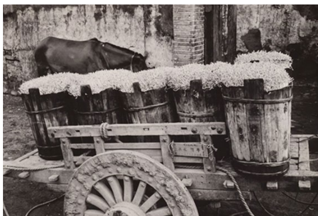
Phaseolus aureus . Peking, China. A cart full of tubs of bean sprouts, produced by the humble mung bean. These bean sprouts are eaten as a vegetable, when scalded, and they are a very tasteful product when served cold as salad with some soy-bean, vinegar and oil sprinkled over them. Sixteen or seventeen catties of dry beans supply from fifty to sixty catties of sprouts. June 28, 1913

The Arnold Arboretum's Frank N. Meyer photograph collection consists of approximately 1,600 various sized black and white photographs mounted on boards, often with several images mounted together on one board, and 150 small, various sized, black and white sleeved photographs. The mounted images include Meyer's detailed descriptions on the verso. The images are filed in the Arboretum's historic photograph collection with photographs of specific plants filed alphabetically by genus and species and general subjects filed alphabetically by country then by local place name. In 2005, the Arboretum digitized 1,344 of Meyer's images of eastern Asia .