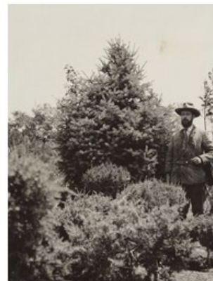
June 1, 1907