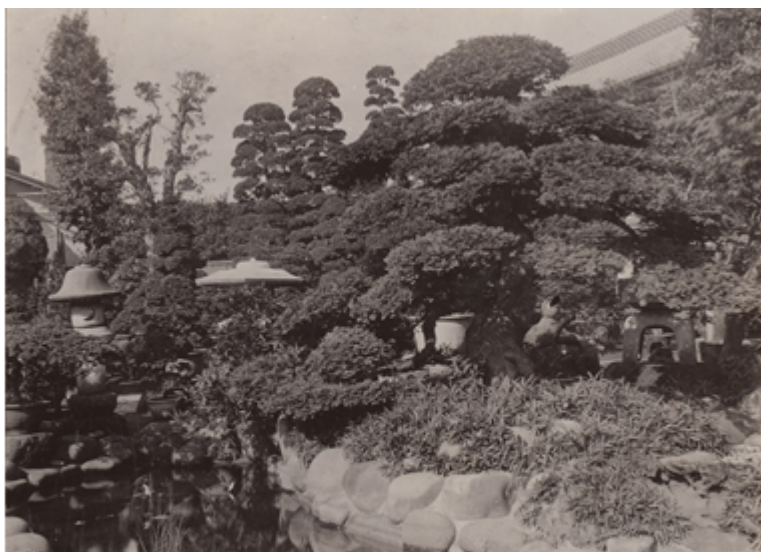
Retinospora obtusa , Yokohama, Japan. Conifers of various species, dwarfed, trained and shaped in all forms, some representing several centuries of painstaking work. In the compound of the Yokohama Nursery Company, Nakamura. October 11, 1916, photograph by Frank Meyer

When Frank Meyer sailed for China in 1905, he began a 13-year odyssey that included four major expeditions that resulted in the introduction of more than 2,000 species and varieties of a wide range of economic plants. He also took hundreds of images that illuminate the passion that he held for nature. Meyer's captions reflect his empathy with the subject matter and reflect his enthusiasm about the potential for improvements in economic botany in the West based on his exploration of the East.