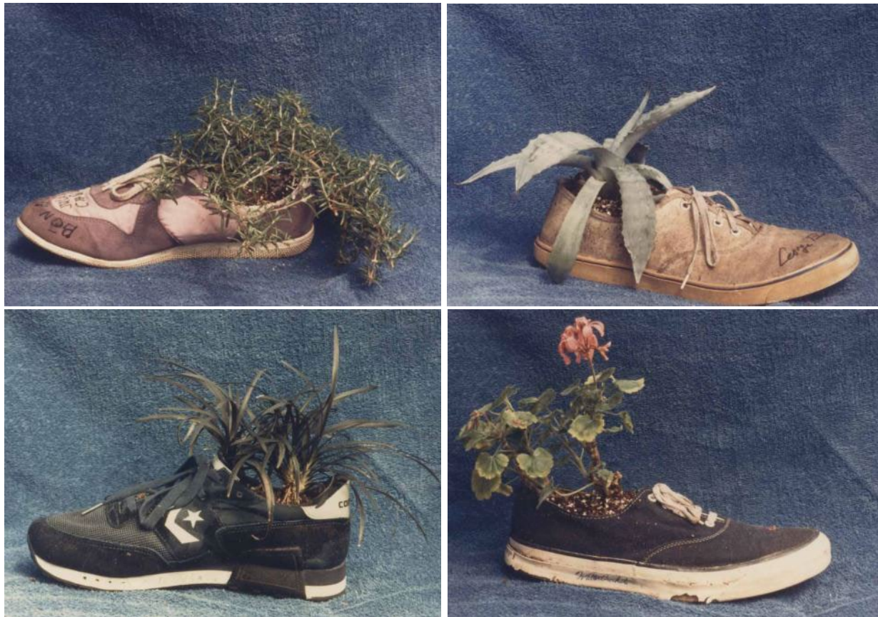
Sneakers donated for Rare Plant Auction, 1986. Top row, left: Julia Childs; right: George Bush. Bottom row, left: Dukakis; right: Walter Cronkite