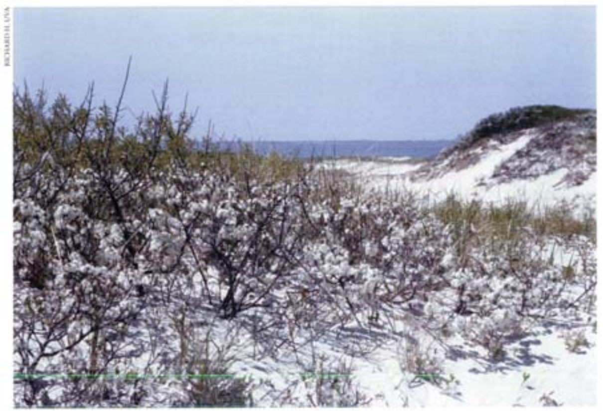
Beach plum on Cape Cod, Massachusetts.

in shape and range from about 1.5 to 2.5 inches in length and half that in width. In early spring, before the leaf buds unfold, clusters of snowywhite blooms emerge to cover the crown of the shrub, creating a frothy splash in the otherwise gray landscape. The individual flowers, only about one-quarter to three-quarters of an inch in diameter, take on a pink hue before dropping off to be replaced by the emerging leaves. The round fruits ripen to a bright red in late August or early September.