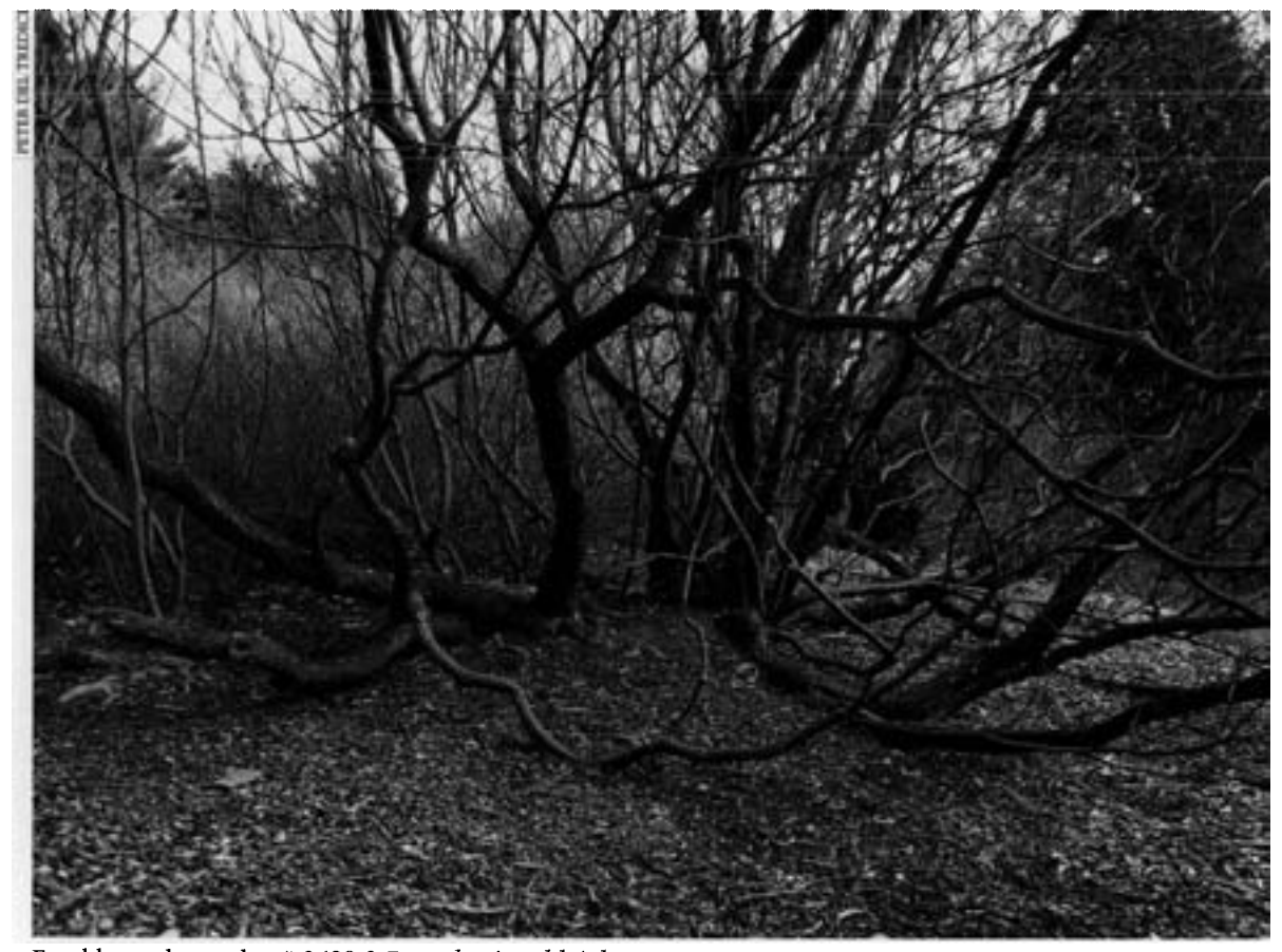
Franklinia alatamaha, # 2428-3-B, at the Arnold Arboretum.

The larger of the two plants (#2428-3-B) is now 21 feet (6.3m) tall by 53 feet (16m) wide and has eight more-or-less vertical "trunks" greater than 5 inches (12cm) in diameter (the largest is 7 inches, or 18cm). The smaller plant (#2428-3-A) is also 21 feet tall but just 30 feet (9m) wide, and has six stems larger than 5 inches in diameter. In the ranks of monumental trees, these are not