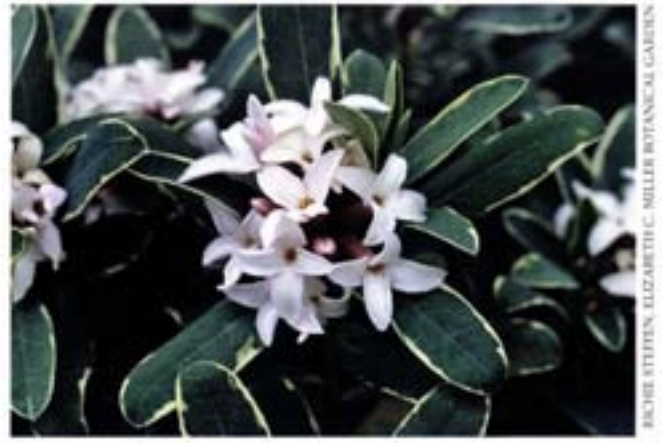
Daphne x transatlantica 'Summer Ice'.

matures to three to four feet in height and width. Currently no specimens of D. genkwa are planted out in the Arboretum's living collections, but one-descendant of wild-collected plants from the former Czech Republic —is growing in the nursery. The Arboretum's plant