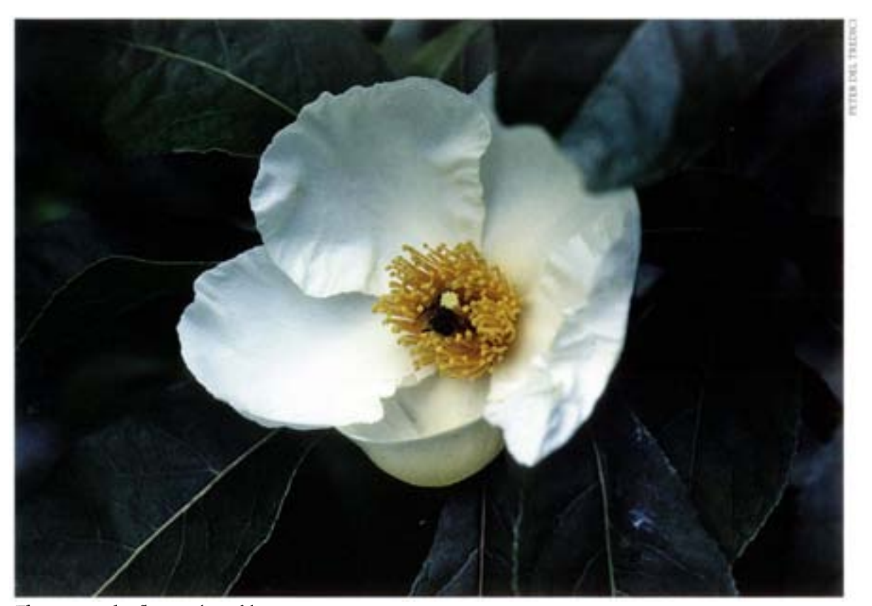
The spectacular flower of Franklinia.

impressive dimensions, but they are enough to place them among the largest Franklinias anywhere in the world. More important, they are the oldest Franklinias of known, documented lineage. To put it another way, we know where the plants came from and when, which is more than most people can say about their Franklinias.