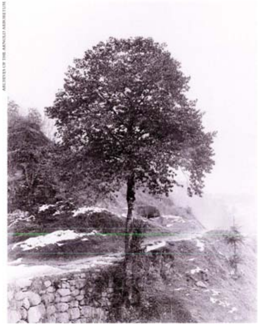
E. H. Wilson photographed this 25-foot-tall longstalk holly in China, 1909. In cultivation the plant attains little more than half that height

The first plants propagated from this seed were set out on the Arboretum's Hickory Path, where their ornamental qualities and hardiness were evaluated for many years. Having performed well at that site, they were moved in 1970 to an area near the Arboretum's administration building, where they still form a distinctive part of the setting.