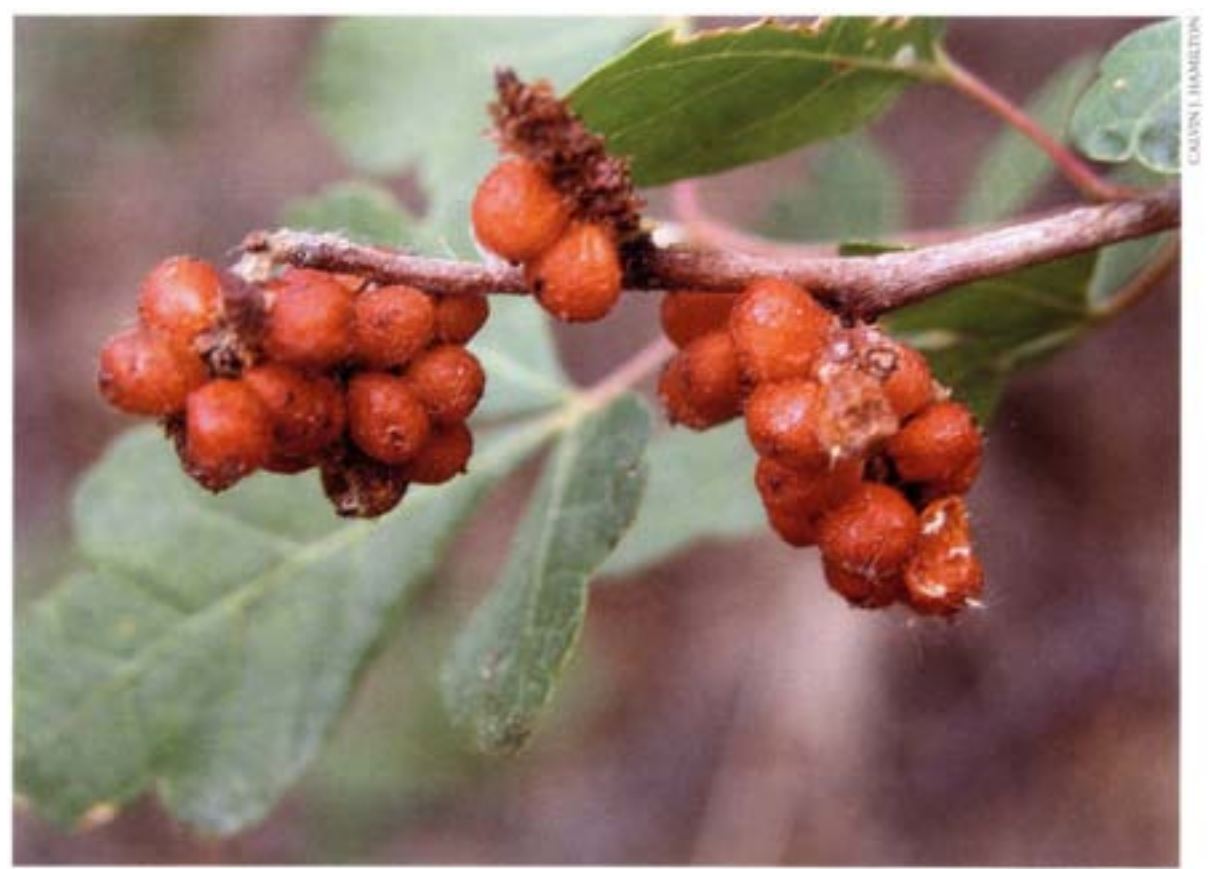
A lemonade-like drink can be made from the attractive red fruits.

Within its native range this deciduous shrub can grow from two to twelve feet tall, with four to six feet being typical in most landscape settings; its height is determined in part