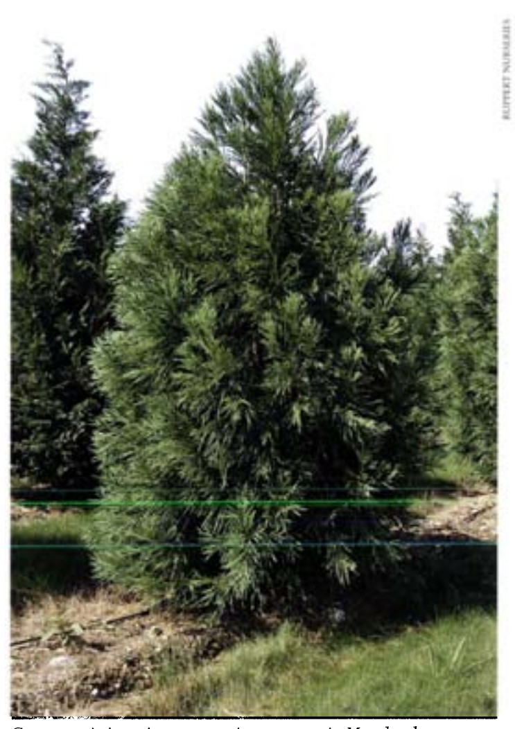
Cryptomeria japonica growing in a nursery in Maryland.