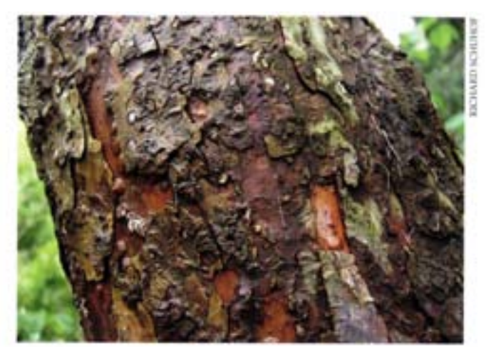
The distinctive bark of the dove tree

If he could see the fully mature specimen of today, Oakes Ames might very well revise his opinion. Now over 30 feet in height, the tree in bloom is without question an outstanding feature of the Arboretum's spring landscape (remember, though, the dove tree is an alternate-year bloomer). You can usually find it in full