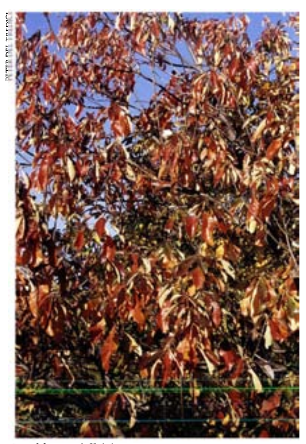
Franklınıa's fall foliage.

increased by layering. If good soil be placed about it, and the layer not disturbed for two years, a strong, well-rooted plant results."<sup>19</sup>