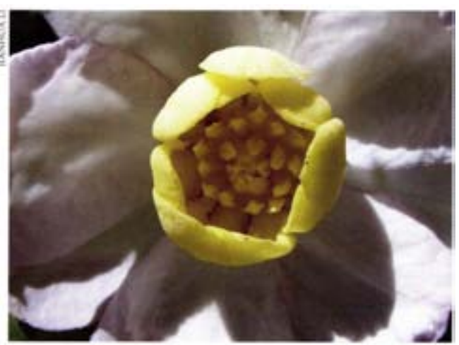
In this closeup of a Calycanthus chinensis flower, the inner and outer whorls of tepals are clearly visible.

many features, including morphology, wood anatomy, pollen, and embryology. Species of Chimonanthus are literally called "waxy prunus" in Chinese because it blooms in winter with waxy yellow flowers that resemble cherries. C. chinensis was first described as a species of Calycanthus<sup>2</sup> and was later recognized as a separate genus, Sinocalycanthus.3 Morphologically, this species differs from other species of Calycanthus in its white flowers and dimorphic (two forms), broadly ovate tepals. Therefore, many authors recognize this species as a separate genus from Calycanthus.4 However, we prefer to treat this plant as a species of Calycanthus for the following reasons.