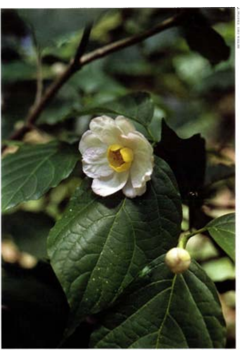
The pendant flowers of Calycanthus chinensis have an unusual, waxy texture.

where evolutionary and taxonomic histories are concerned, C. chinensis definitely provokes more interest. As a practical matter, the species is rare in the wild and needs our help to survive.