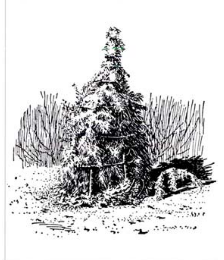
This drawing appears in The Standard Cyclopedia of Horticulture, rev. ed., 1916, with this caption: "A tender tree bound in branches of hemlock. The protected tree is a specimen of gordonia [Franklinia] about 10 feet high, at Arnold Arboretum, Boston."