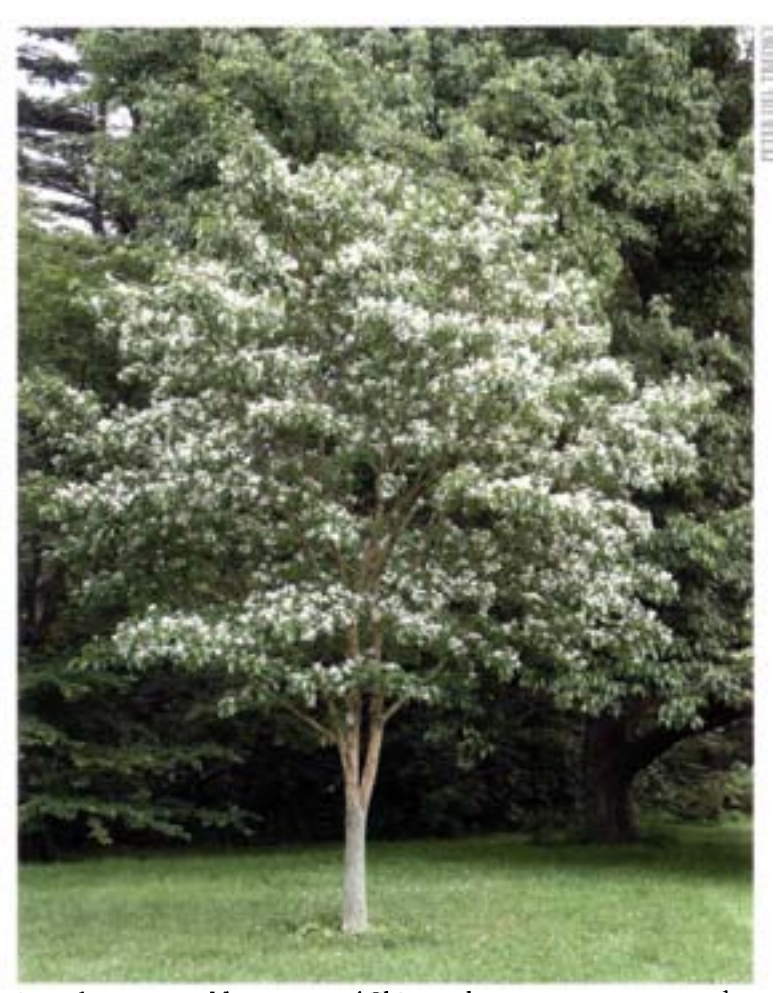
An eighteen-year-old specimen of Chionanthus retusus growing at the Arnold Arboretum. Note the single-stemmed growth habit that has developed without pruning.

When young, the Chinese fringetree's bark is a pale buff color, peeling off in papery strips. On mature trees, the bark is tight, with distinct ridges and furrows. The lustrous leaves are elliptic to ovate in shape, three to eight inches long and one-and-one-half to four inches wide. The white flowers, each with four straplike petals, are about an inch across and give off a delicate fragrance. They are produced at