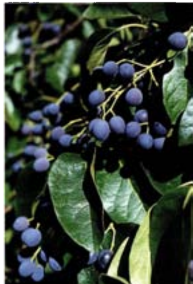
The showy flowers and blue-purple fruit of Chionanthus retusus.

ditions. It is generally not bothered by insect pests or diseases.