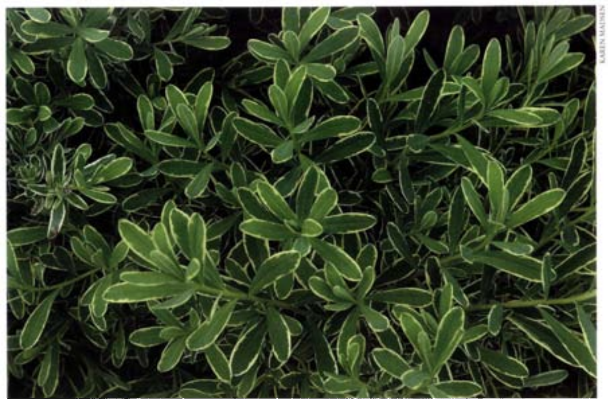
The variegated leaves of Daphne x burkwoodii 'Carol Mackie'.

planting once established in the garden; it is best to plant container-grown stock in a permanent location. Keep pruning to a minimum, with judicious deadheading and light tip pruning. Do not try to rejuvenate plants by cutting back hard this can easily sound the death knell.