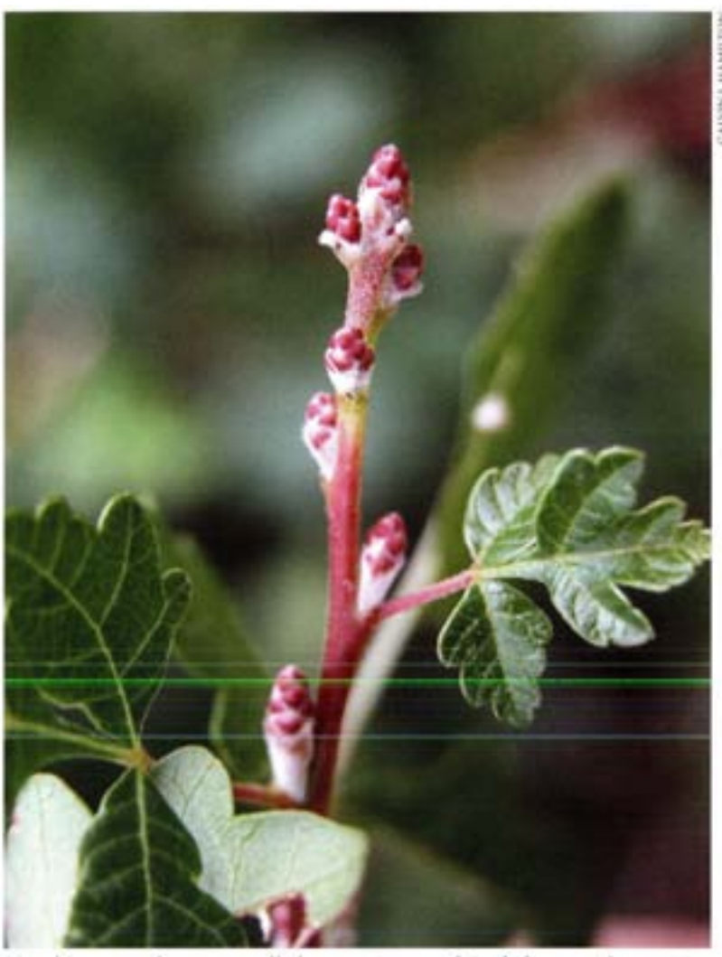
New leaves are downy, usually becoming smooth and glossy with maturity. In fall the green gives way to yellows, orange, reds, and reddish purple.

In spring Rhus trilobata blooms before its foliage appears, the flowers emerging from short, catkin-like spikes borne at the branch tips. Individual flowers may be unisexual or bisexual, with both types occurring on most plants. Only about one-eighth inch long, they are light yellow or greenish yellow and have five petals. The fruit is a red, subglobose (not perfectly round) drupe about one-quarter inch long, slightly hairy and a bit sticky on the surface and containing a single dark brown nutlet. Mature