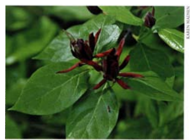
The flowers of our native eastern sweetshrub differ from those of their Chinese relative both in form and fragrance.

When Calycanthus chinensis was first introduced into cultivation in North America in the early 1980s, its hardiness was unknown. 7 But experience at the Arnold Arboretum has shown the plant to be fully hardy in USDA zone 6, hav-