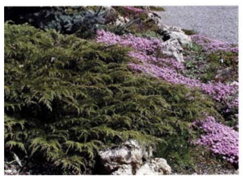
Microbiota decussata has a natural affinity for rocks

brown" while those who find it appealing describe the color as anything from "magnificent copper" to "rich bronze" or "burgundy purple." Beauty (and color descriptions) are clearly in the eye of the beholder. Plants grown where they are shaded during the winter show less bronzing than those in full sun. Some plants seem to green up more quickly than others in the spring; perhaps in the future nursery growers should select for this trait in new cultivars.