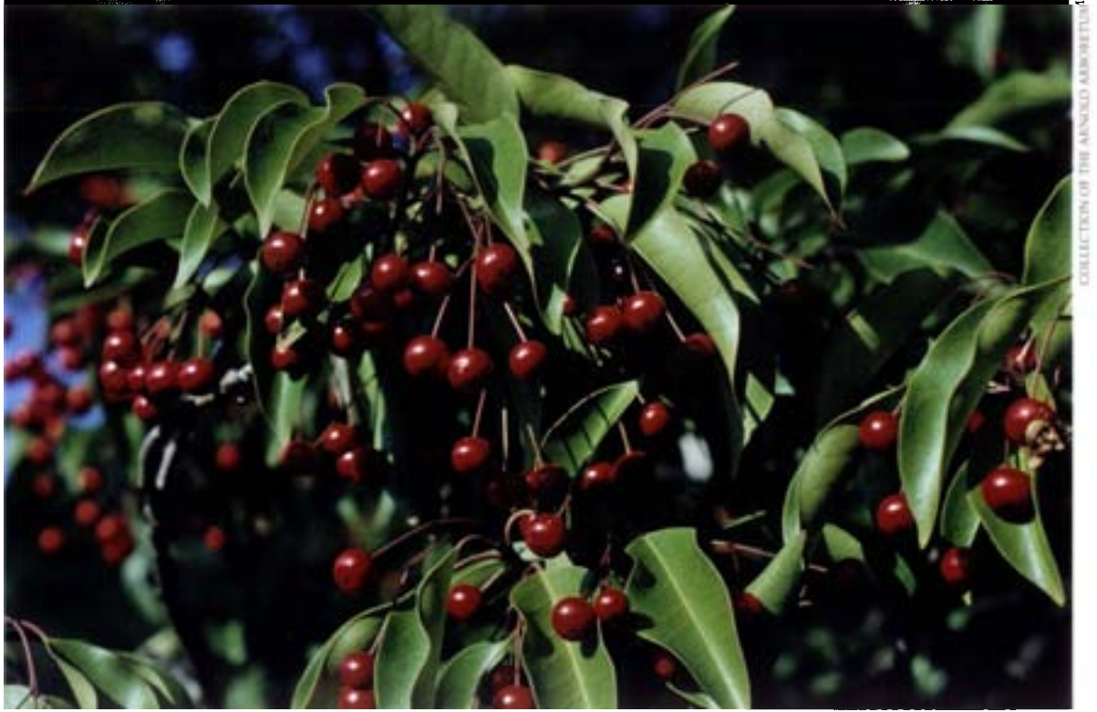
With lustrous leaves, bright red fruit, and dependable hardiness throughout zone 5, the longstalk holly is a broadleaf evergreen that few in New England can rival

The plant that had so impressed Sargent was Ilex pedunculosa , the longstalk holly, first described for publication by the Dutch botanist Friedrich Anton Wilhelm Miquel in 1868. Its affinity with the hollies of New England made it of particular interest to Sargent, who was committed to researching the similarities between the floras of eastern Asia and eastern North America. The plant's appeal was further enhanced by Sargent's desire to add plants of significant ornamental value to the Arnold Arboretum's collection. Later Sargent hired the British plant explorer E. H. Wilson to further pursue the study of Asian flora, and in 1907 Wilson sent seeds of I. pedunculosa from China back to Boston.